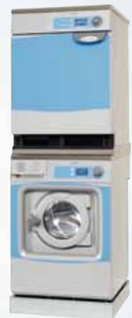
A stacked pair